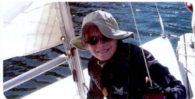
Summer Sailing Camp details will be available by May 2012!

Teens $135R $140NR M-F April 9-13 1-4pm Des Moines Marina