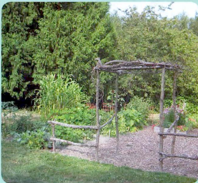
2012 Sonju Community Orchard and Garden Season Opens in April