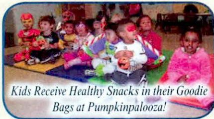
Kids Receive Healthy Snacks in their Goodie Bags at Pumpkinpalooza!

The City of Des Moines recently received a grant from Public Health - Seattle & King County and the U.S. Department of Health and Human Services to develop a new Healthy Eating and Active Living (HEAL) Initiative!