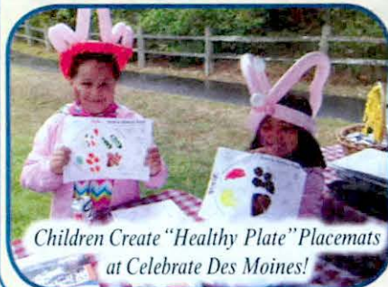
Children Create “Healthy Plate” Placemats at Celebrate Des Moines!